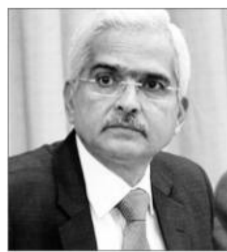
RBI governor Shaktikanta Das

THE RESERVE BANK of India on Thursday said the first purchase of government securities (G-Sec) worth ₹25,000 crore under the G-sec Acquisition Programme (G-SAP 1.0) will be done on April 15 with a view to enabling a stable and orderly evolution of the yield curve.