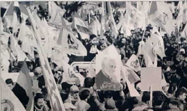
Tens of thousands of people marched in Baghdad on Saturday to mourn the deaths of Iran's military chief Qasem Soleimani and Iraqi militia leader Abu Mahdi al-Muhandis, who were killed in a US air strike, raising the spectre of conflict in the Middle East

US PRESIDENT DONALD Trump has said Iranian General Qasem Soleimani had made the death of innocent people his 'sick passion' and contributed to terrorist plots as far away as New Delhi and London, a day after ordering the drone attack that killed the powerful Revolutionary Guards commander in Iraq. Soleimani, 62, the head of Iran's elite al-Quds force and architect of its regional security apparatus, was killed when a drone fired missiles into a convoy that was leaving the Baghdad International Airport early on Friday. In his first comments since the killing of the Iranian mili-