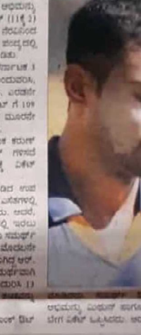
ರಣಜಿ ಟೆಸ್ಟ್‌ನಲ್ಲಿ ಕರ್ನಾಟಕ ತಂಡವು ಮುಂಬೆ (52%) ಮತ್ತು ದೆಹಲಿ (11%) ಮೇಲೆ ಹಿಡಿತ ಸಾಧಿಸಿದೆ. ಇದು ಕರ್ನಾಟಕ ತಂಡದ ದೊಡ್ಡ ಸಾಧನೆ.

ಮುಂಬೆ: ರಣಜಿ ಟೆಸ್ಟ್‌ನಲ್ಲಿ ಕರ್ನಾಟಕ ತಂಡವು ಮುಂಬೆ (52%) ಮತ್ತು ದೆಹಲಿ (11%) ಮೇಲೆ ಹಿಡಿತ ಸಾಧಿಸಿದೆ. ಇದು ಕರ್ನಾಟಕ ತಂಡದ ದೊಡ್ಡ ಸಾಧನೆ.