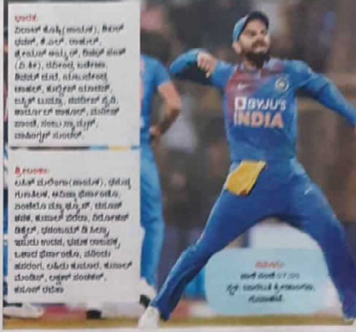
ಇಂಡೋ-ಲಂಕಾ ಮೊದಲ ಚುಟುಕು ಕದನವು ಇಂದು ಮುಂದುವರಿದು ಹೋಗಲಿದೆ. ಲಂಡನ್ ನಗರದಲ್ಲಿ ಏರ್ಪಡಿಸಲಾಗುವ ಈ ಕದನವು ಲಂಡನ್ ನಗರದ ಜನರನ್ನು ಆಕರ್ಷಿಸಲಿದೆ.

ಇಂಡೋ-ಲಂಕಾ ಮೊದಲ ಚುಟುಕು ಕದನವು ಇಂದು ಮುಂದುವರಿದು ಹೋಗಲಿದೆ. ಲಂಡನ್ ನಗರದಲ್ಲಿ ಏರ್ಪಡಿಸಲಾಗುವ ಈ ಕದನವು ಲಂಡನ್ ನಗರದ ಜನರನ್ನು ಆಕರ್ಷಿಸಲಿದೆ. ಇಂಡೋ-ಲಂಕಾ ಮೊದಲ ಚುಟುಕು ಕದನವು ಇಂದು ಮುಂದುವರಿದು ಹೋಗಲಿದೆ.