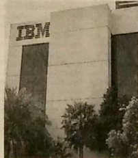
IBM's shares fell more than 3 per cent in extended trading Thursday

IBM forecast a 2018 operating tax rate of 16 per cent, plus or minus 2 percentage points, compared with a rate of 12 per cent in 2017. "This will be a headwind in