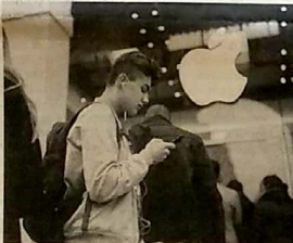
The South Korean advocacy group accused Apple of destruction of property and fraud

Apple Korea, the US tech firm's South Korean subsidiary, was not immediately available for comment.